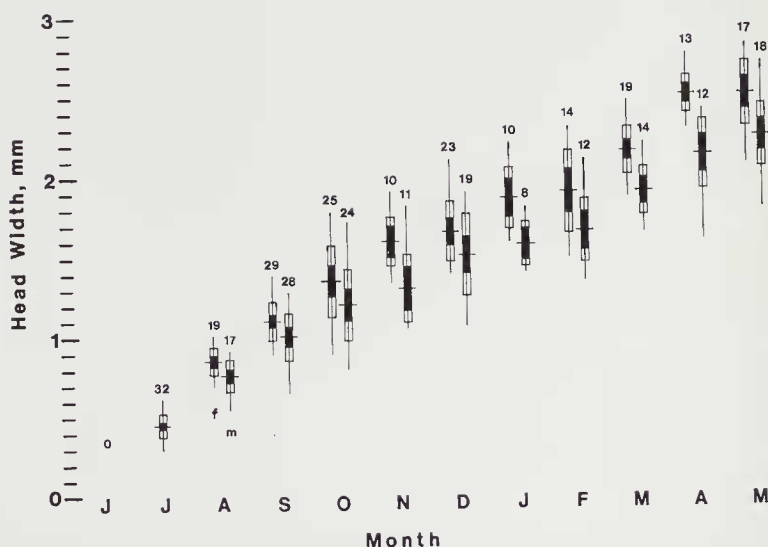
Figure 2. Population range diagram showing monthly head width variations in B. bajkovi nymphs, Beech Fork of Twelvepole Creek, Wayne County, West Virginia, 1976-77. Vertical lines = range, horizontal lines = mean, open rectangles = one standard deviation, dark rectangles = two standard errors of the mean, numbers = sample size, f = females, m = males.

known to what extent they may be a part of the regular diet or ingested accidentally along with other food items. The most noticeable monthly variations in diet composition were the increase in plant detritus during the fall months, probably due to the large amount of leaves in the stream, and the increase in the abundance of diatoms in the spring months.